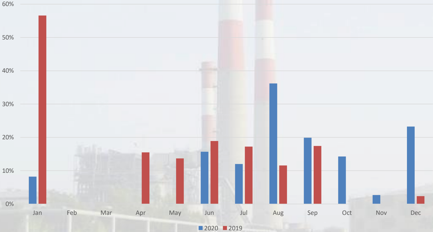
Capacity Utilization (%age) 2020 vs 2019